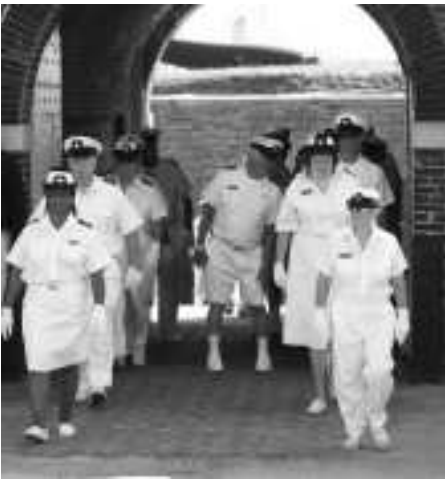
The Honor Guard enters Ft. McHenry