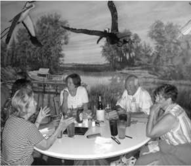
They came from the south...