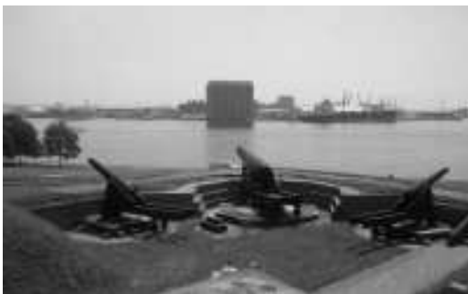
Protecting Baltimore's inner harbor