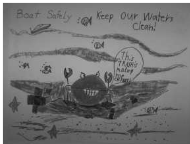
Lane Sweaney 6 - 8