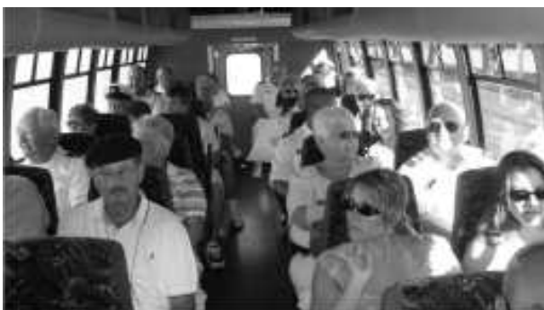
Bus loads from the marina to Ft. McHenry for the flag raising