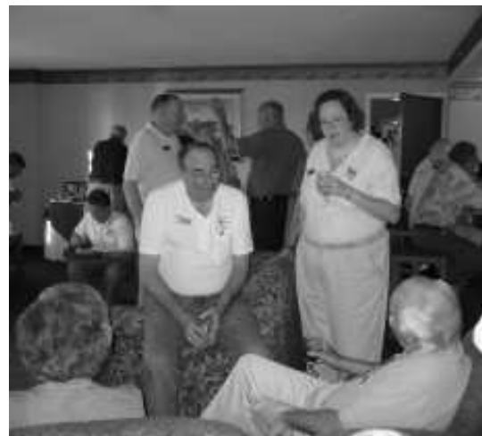
Relaxing at the end of the day