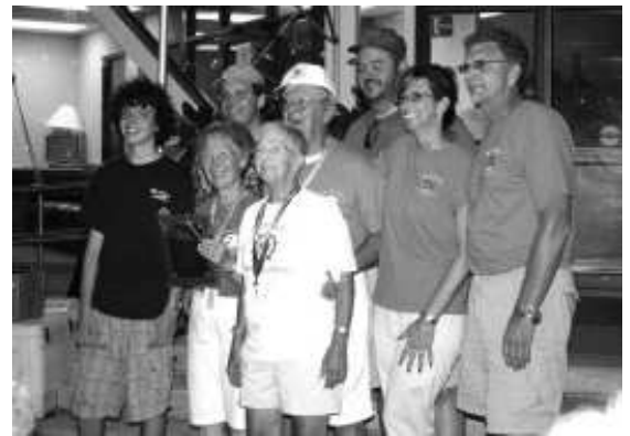
Rat Ark crew