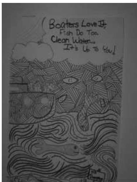
Kathleen Murray 12 - 14