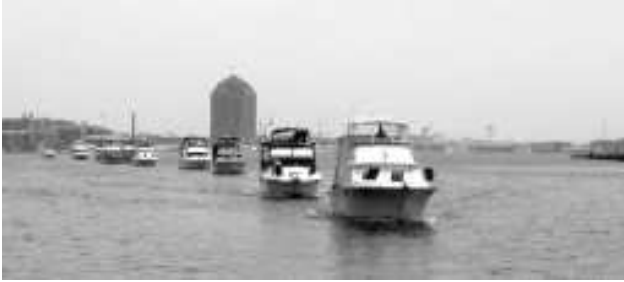
D/5 boats follow One Moor Time into Baltimore Harbor