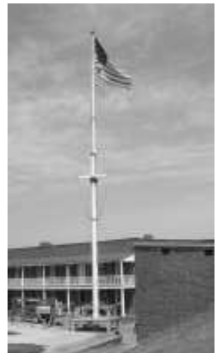
"in triumph shall wave..."