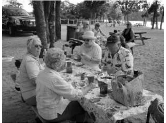
and they came from the north.