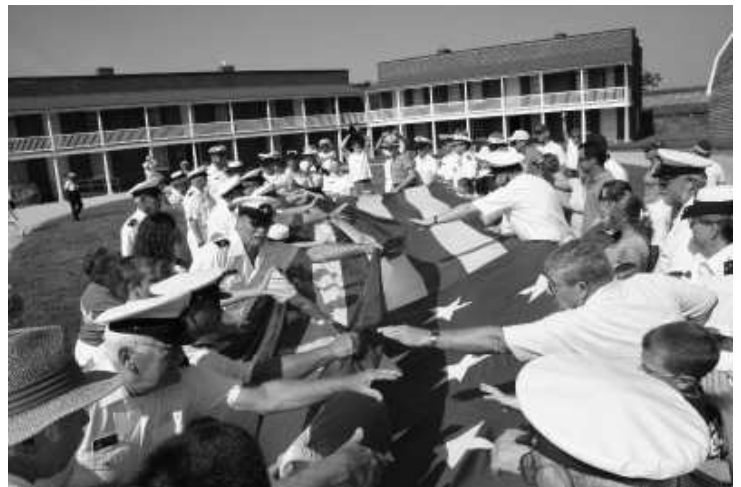
Squadron members helped unfold the storm flag