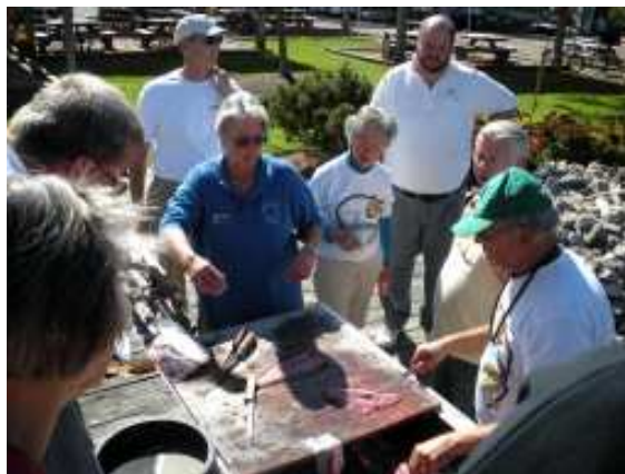
You catch 'em - you clean 'em