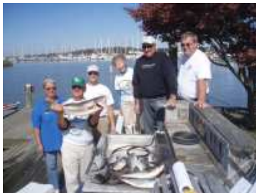
Catch of the day!