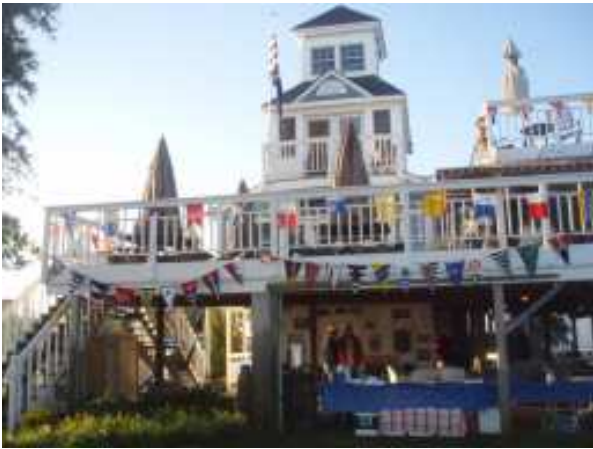
Rockhall welcomes District 5