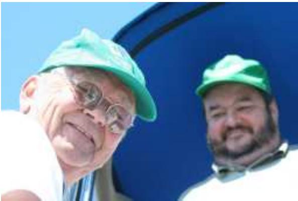
Nothing puts a smile on a man's face like fishing!