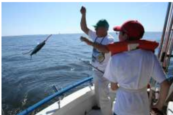
Or, better yet, fishing with a boy.