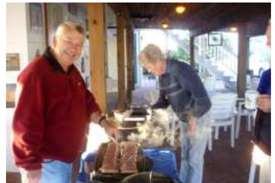
Lots of good food