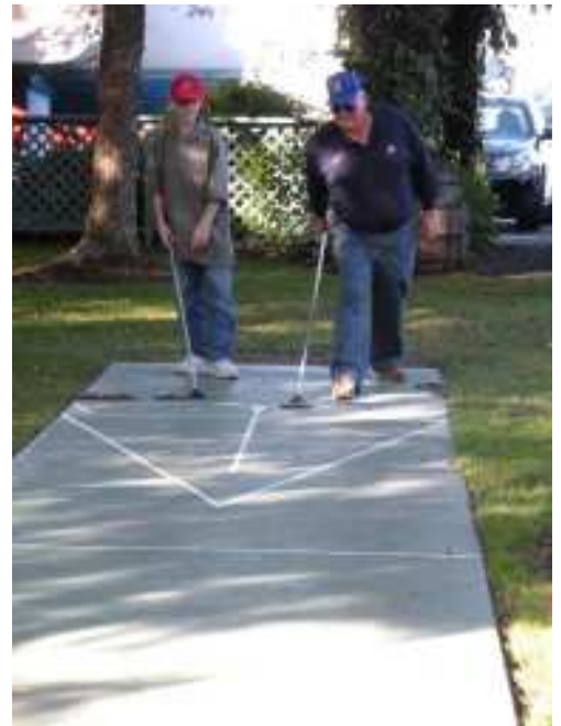
A little something to do on land