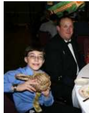
A happy raffle winner!